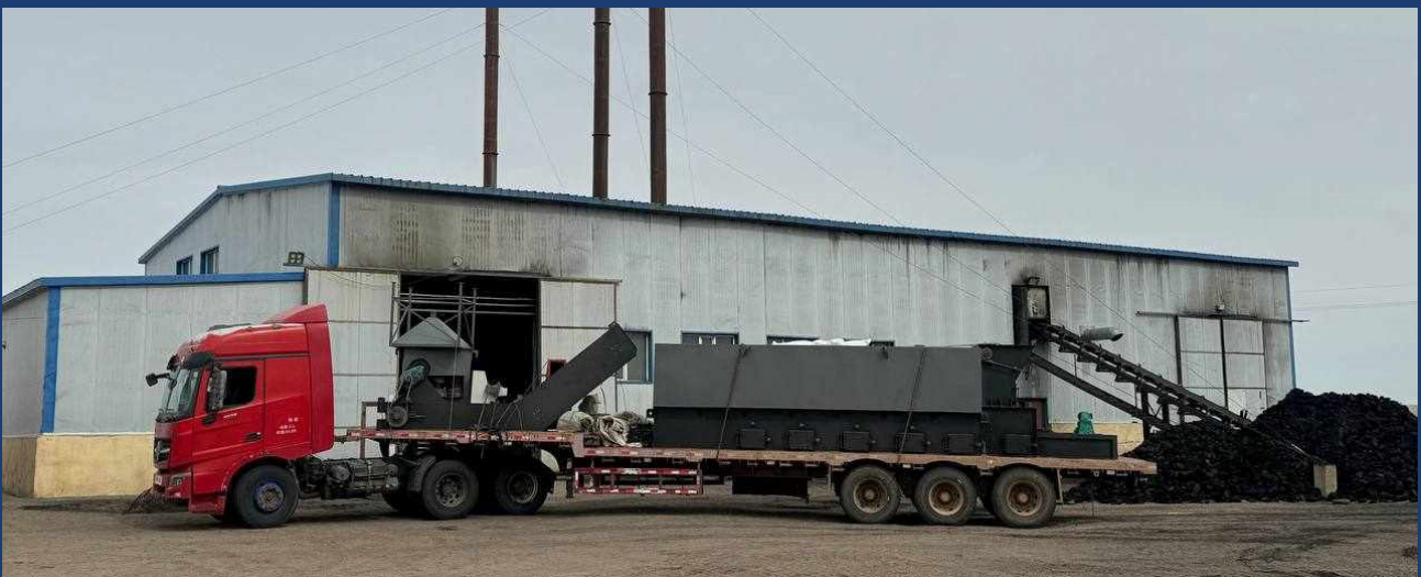
Photos 3: Delivery of new boilers to be installed in steam heating station of Zuunbayan bagh of Sainshand soum of Dornogovi aimag