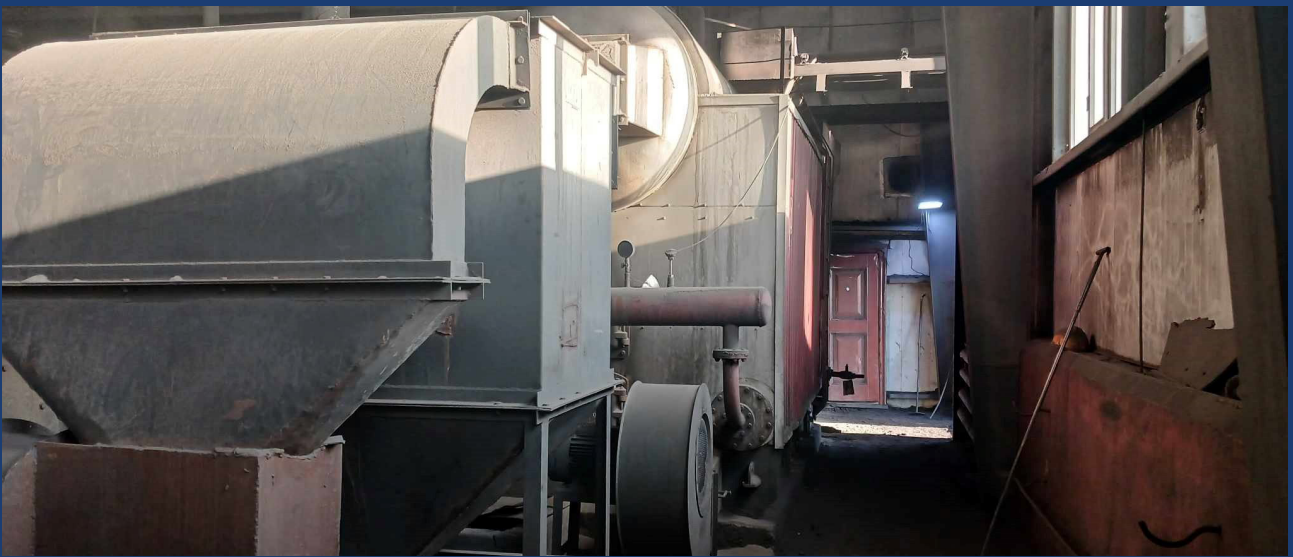
Photos 1-2: Steam heating station of Zuunbayan bagh of Sainshand soum of Dornogovi aimag before replacement